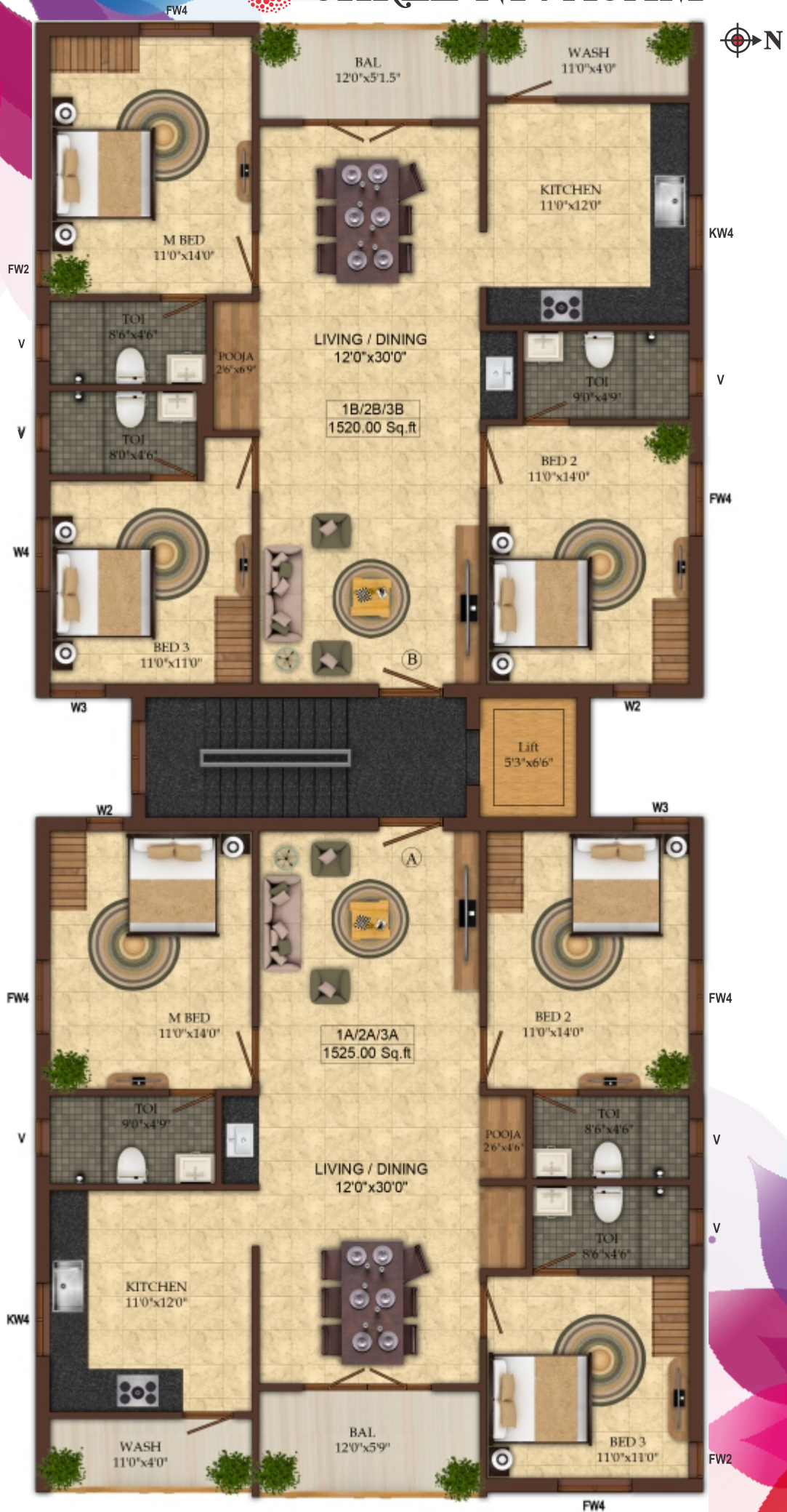
Typical Floor Plan - I, II, III, IV