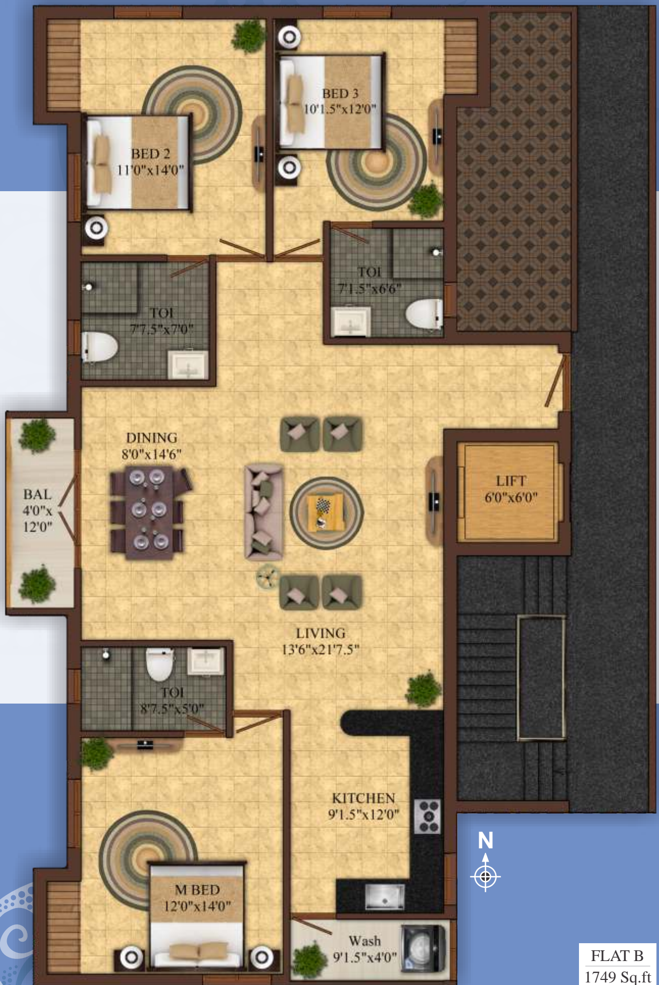
FLAT B 1749 Sq.ft