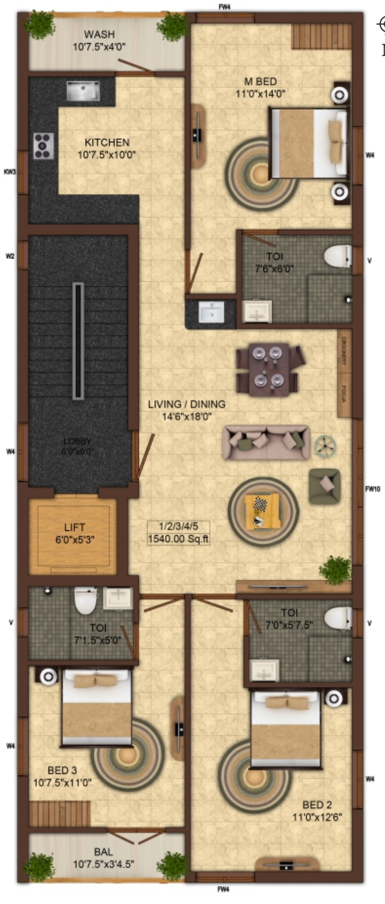
Typical Floor Plan - I, II, III, IV, V