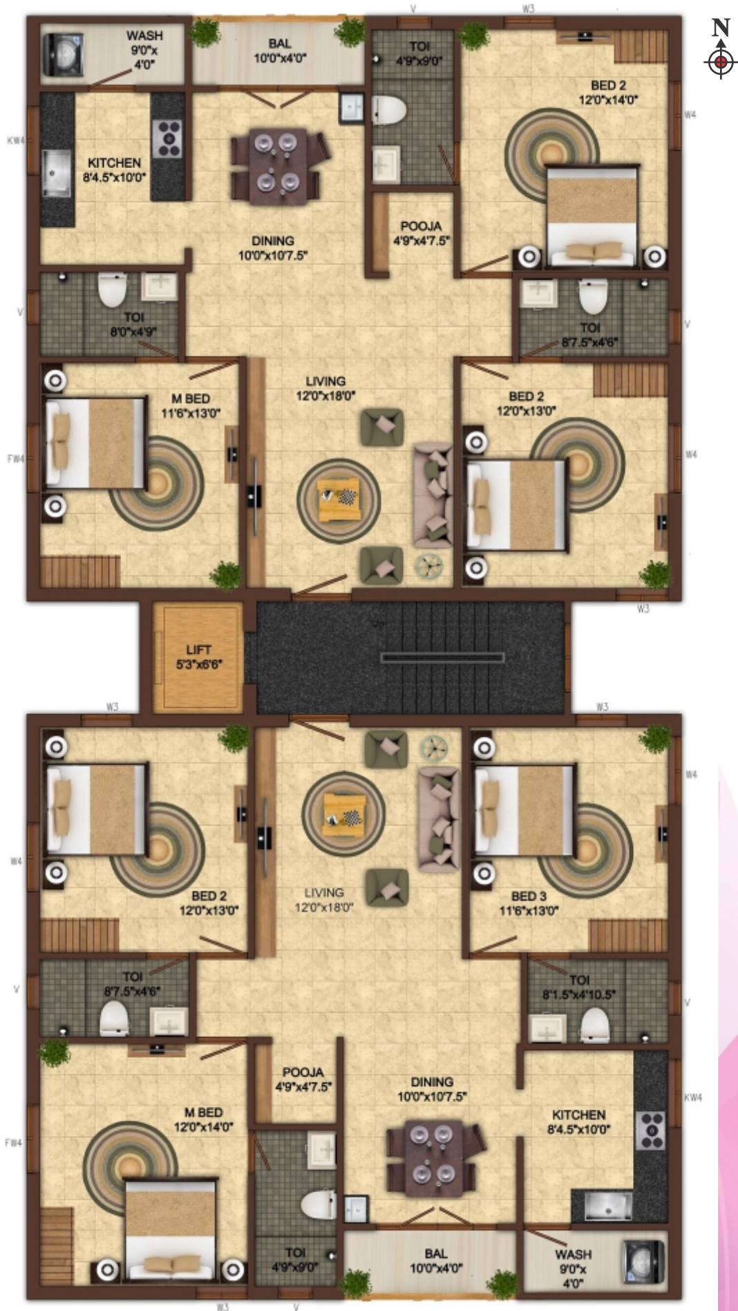
Typical Floor Plan - I, II, III, IV