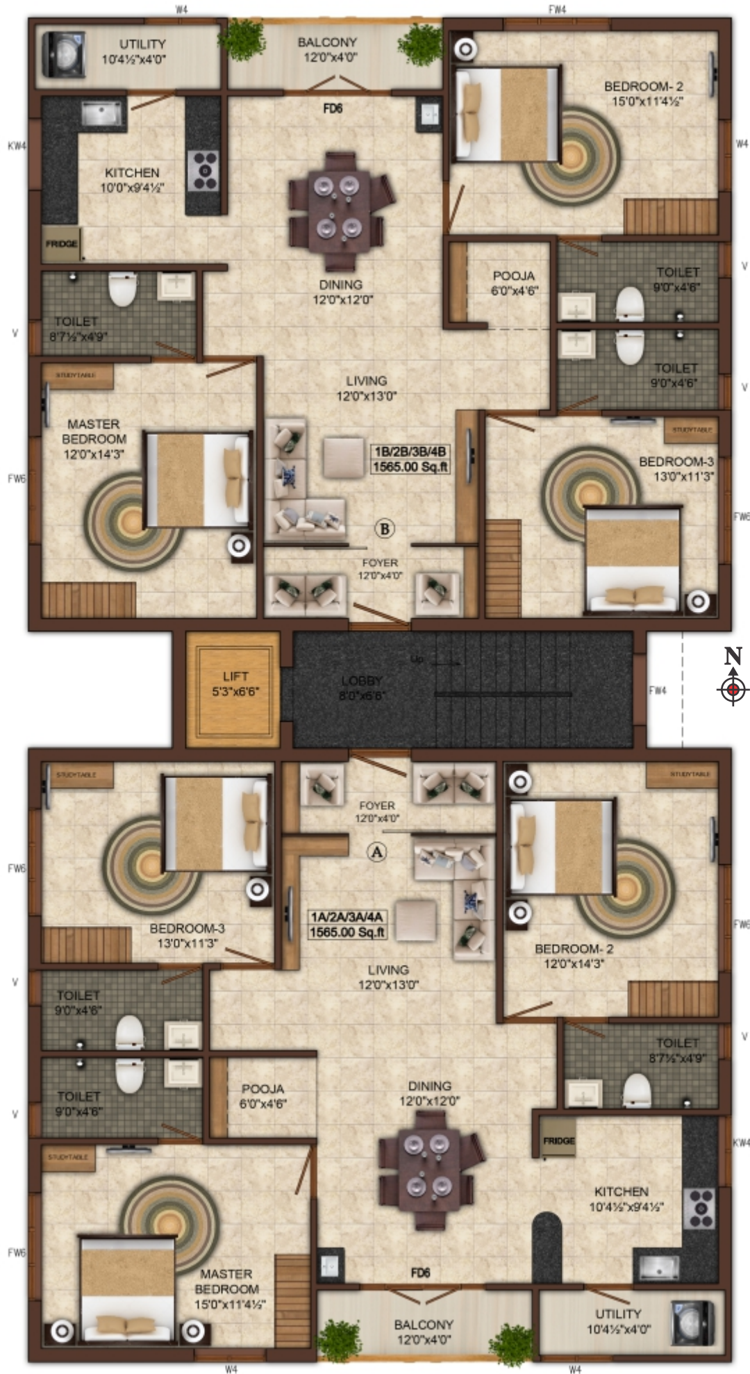
Typical Floor Plan - I, II, III, IV