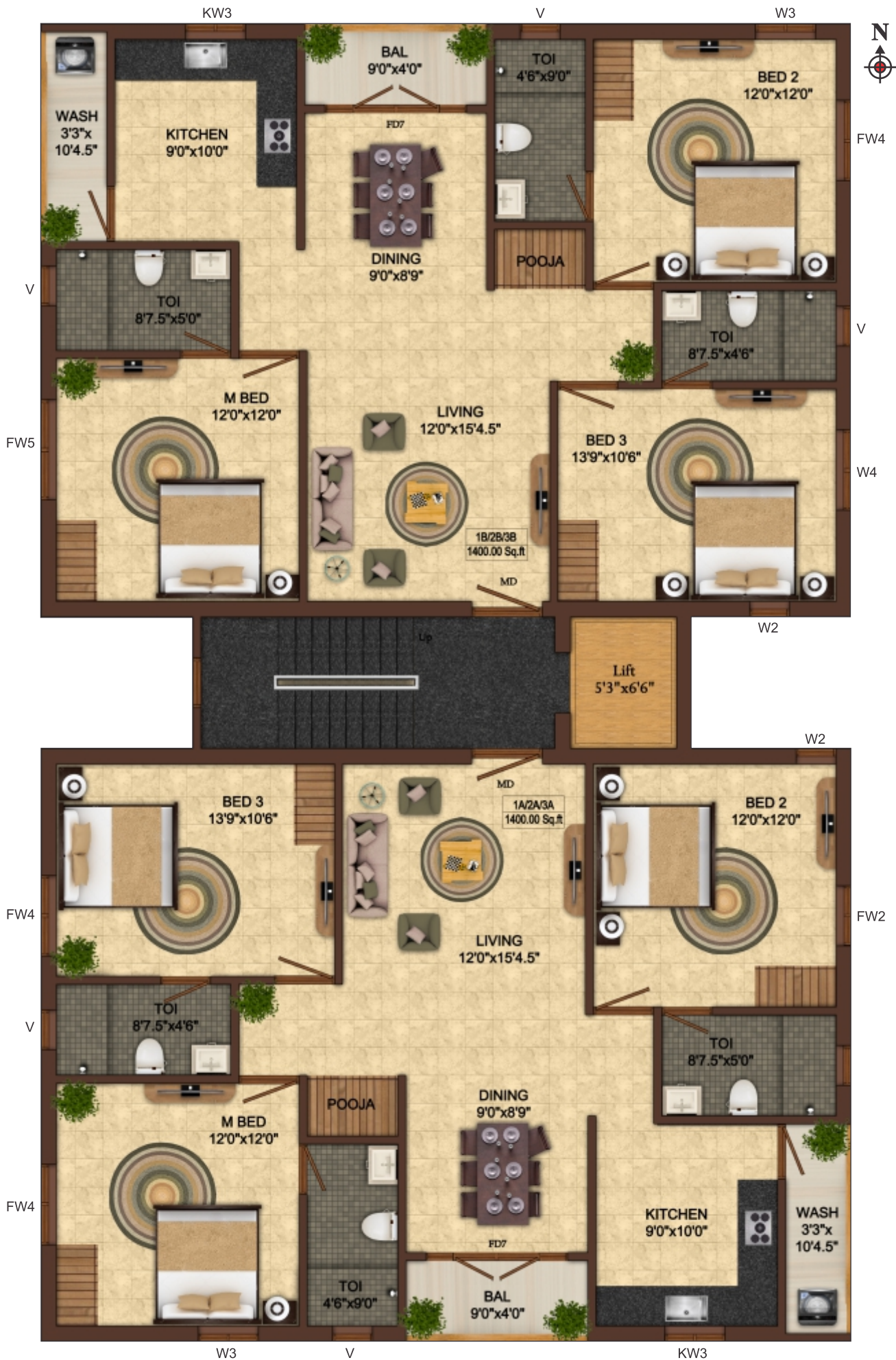
Typical Floor Plan - I, II, III