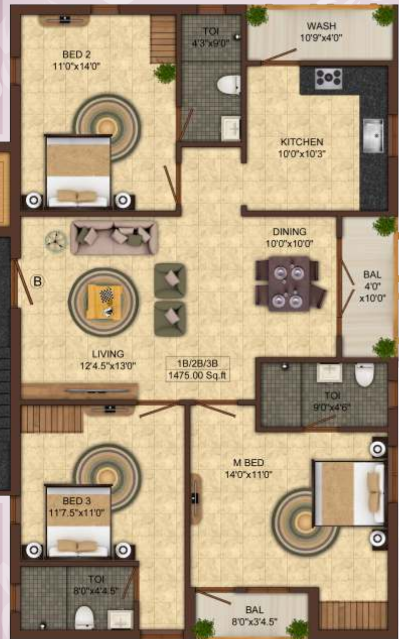
Typical Floor Plan - I, II, III