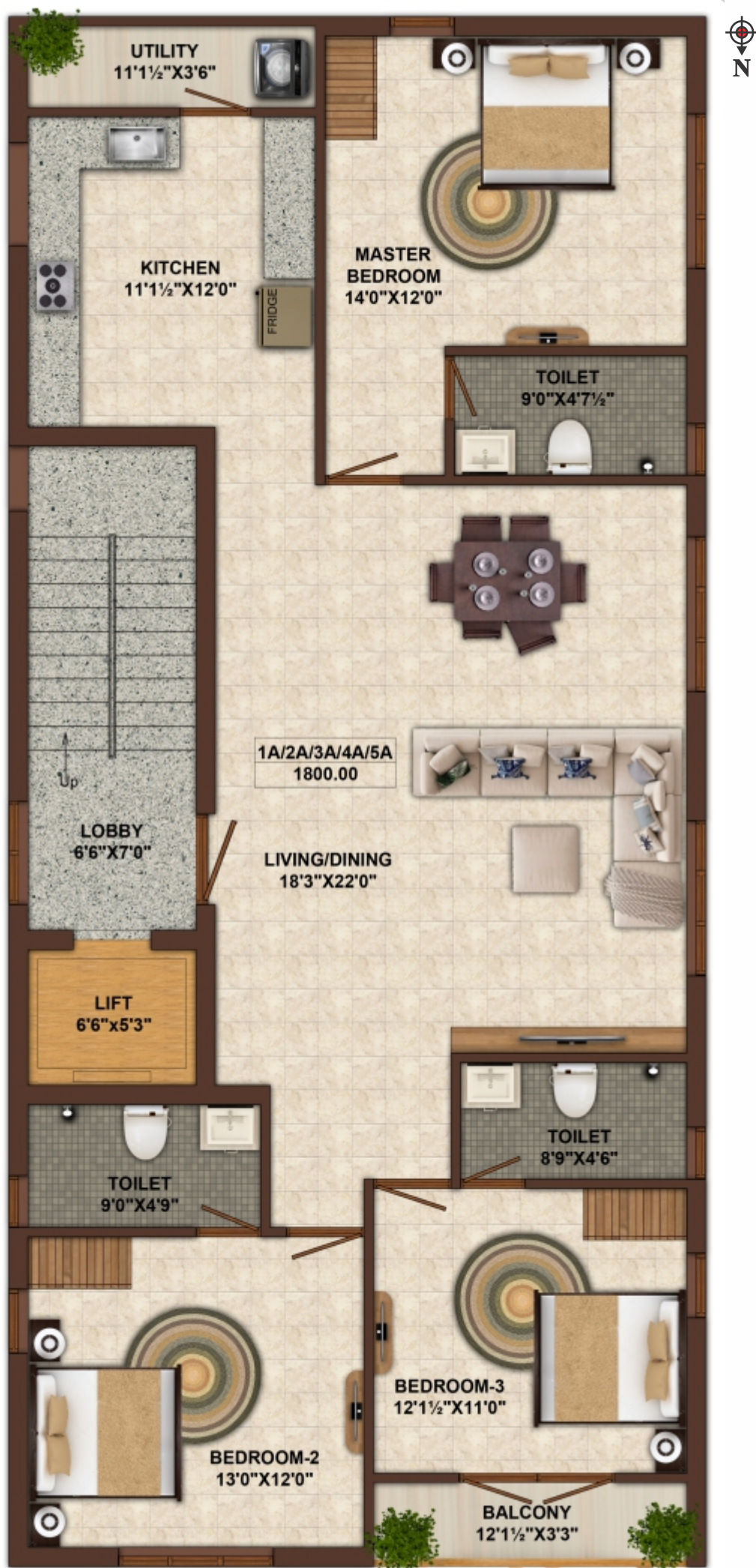
Typical Floor Plan - I, II, III, IV, V