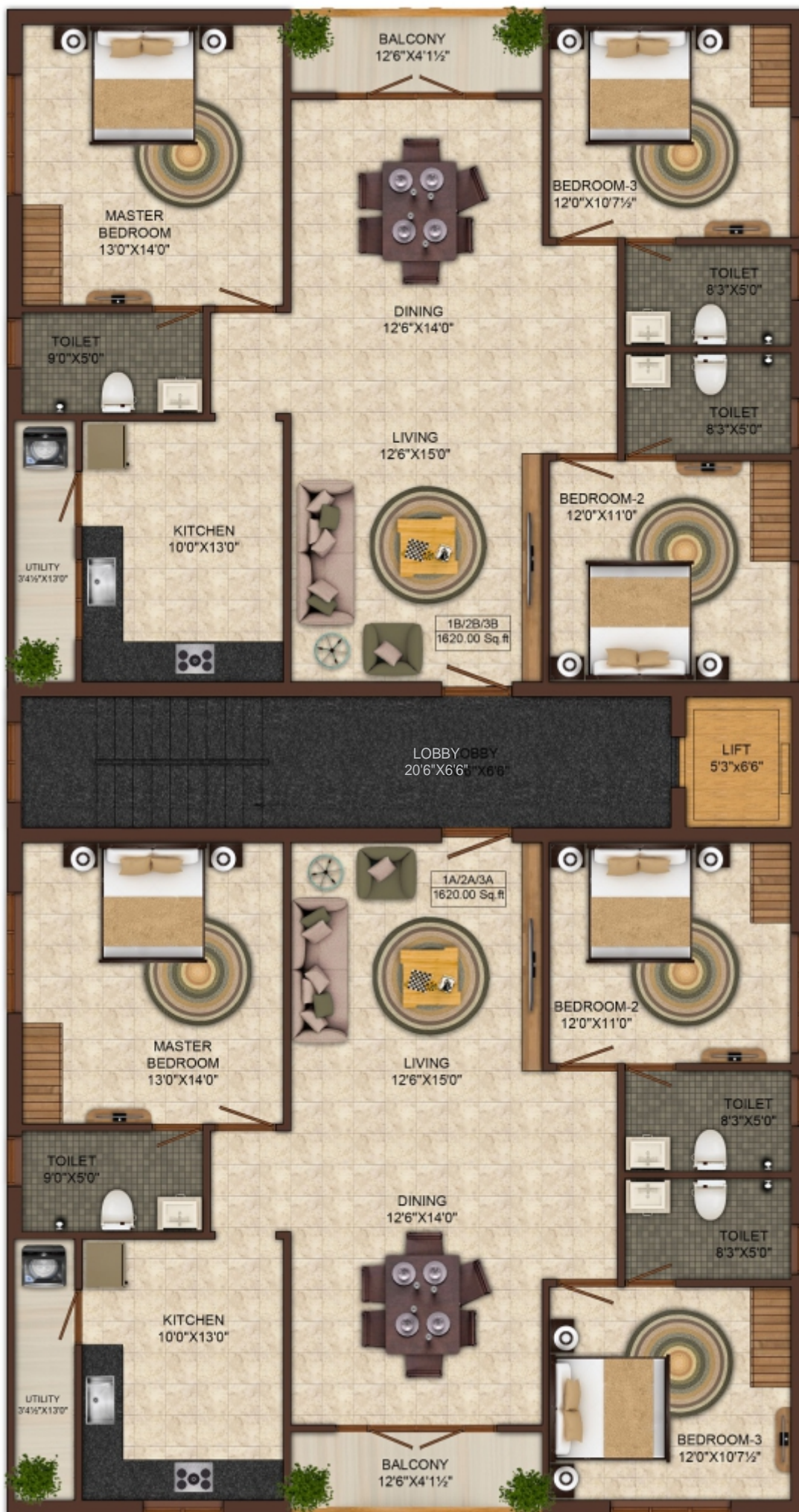
Typical Floor Plan - I, II, III