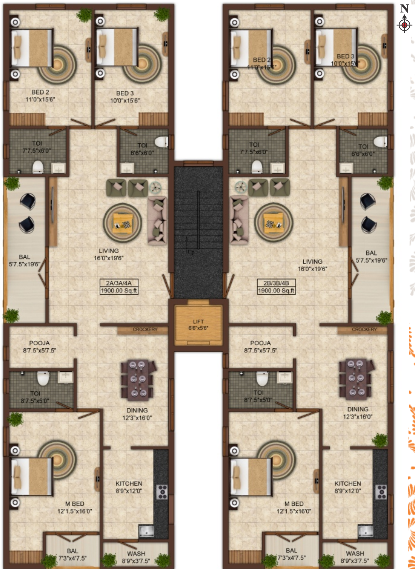
Typical Floor Plan - II, III, IV