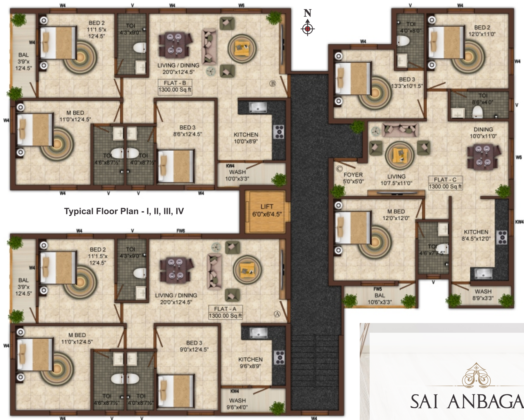
Typical Floor Plan - I, II, III, IV