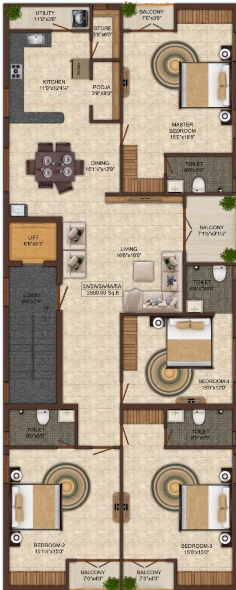
Typical Floor Plan - I, II, III, IV, V