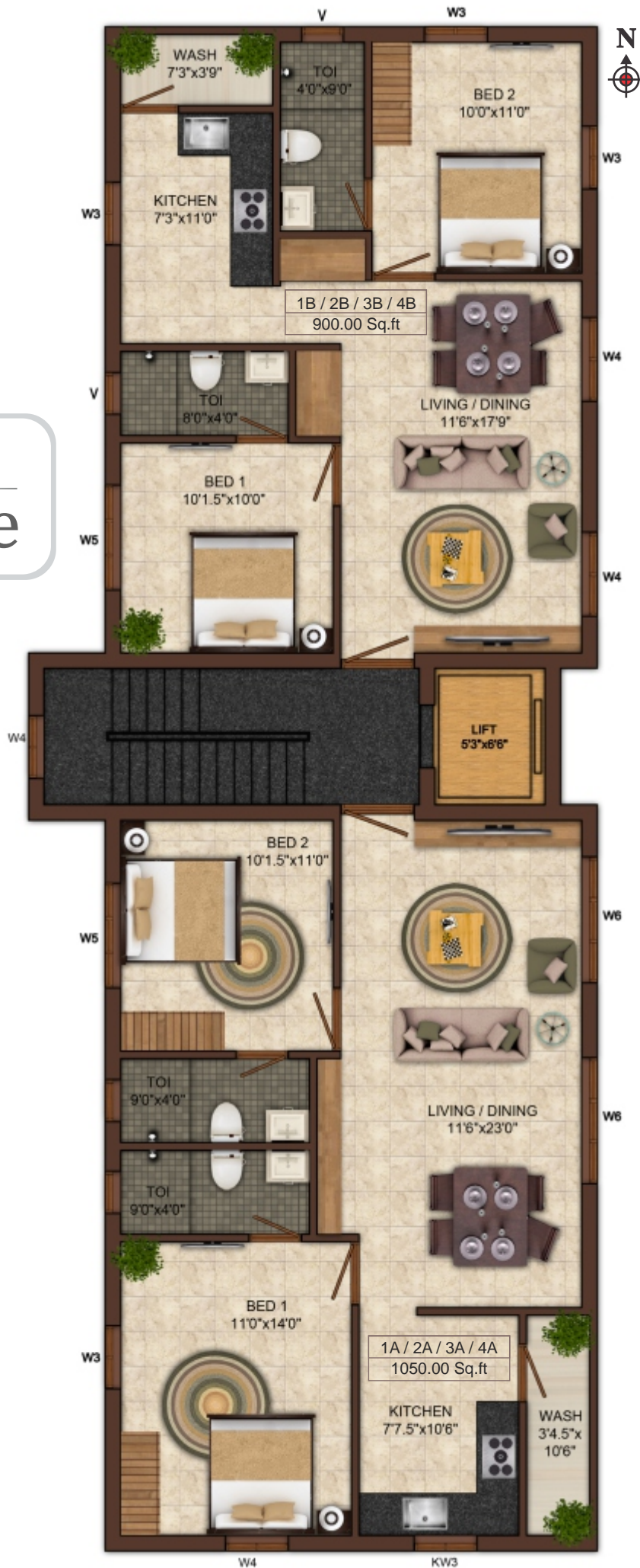
Typical Floor Plan - I, II, III, IV