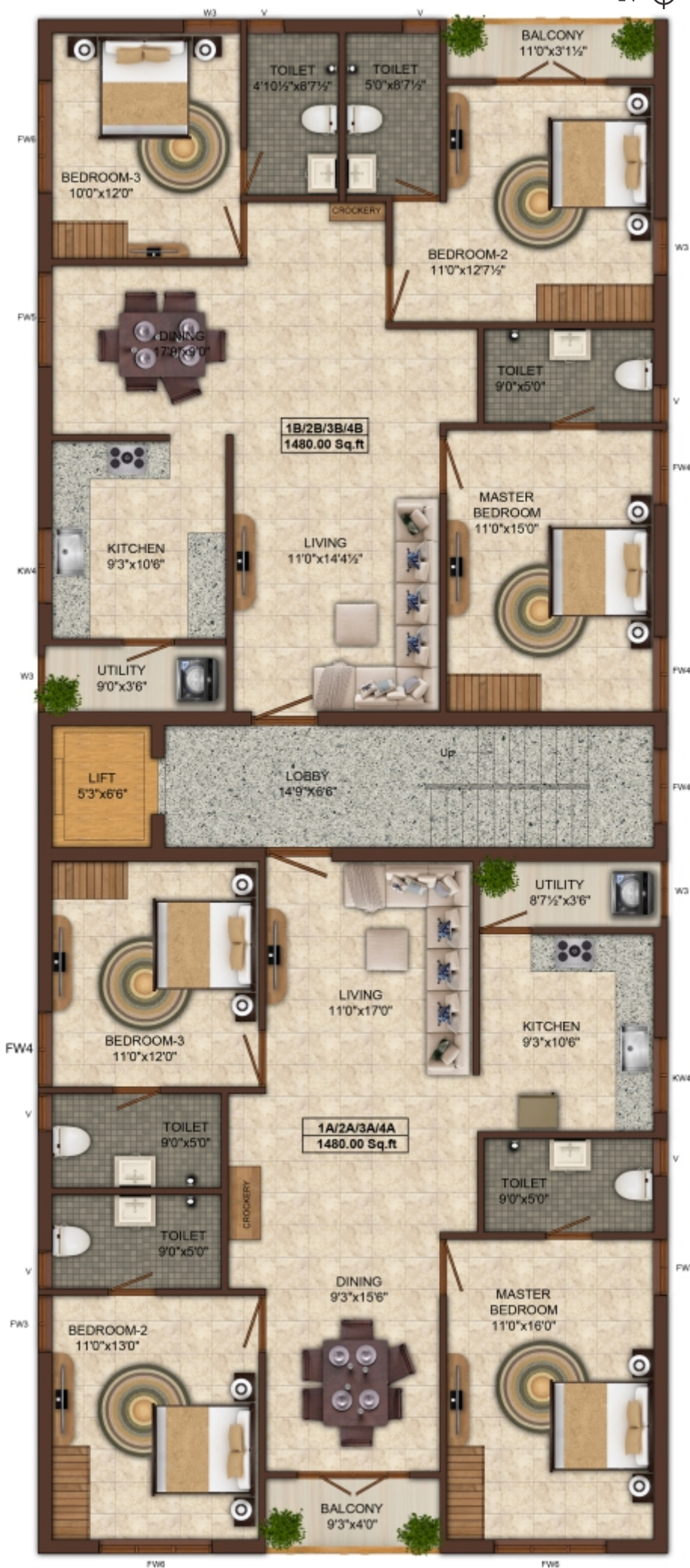
Typical Floor Plan - I, II, III, IV