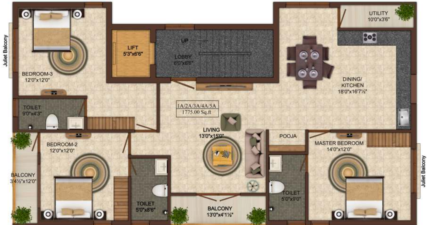
Typical Floor Plan - I,II,III,IV and V