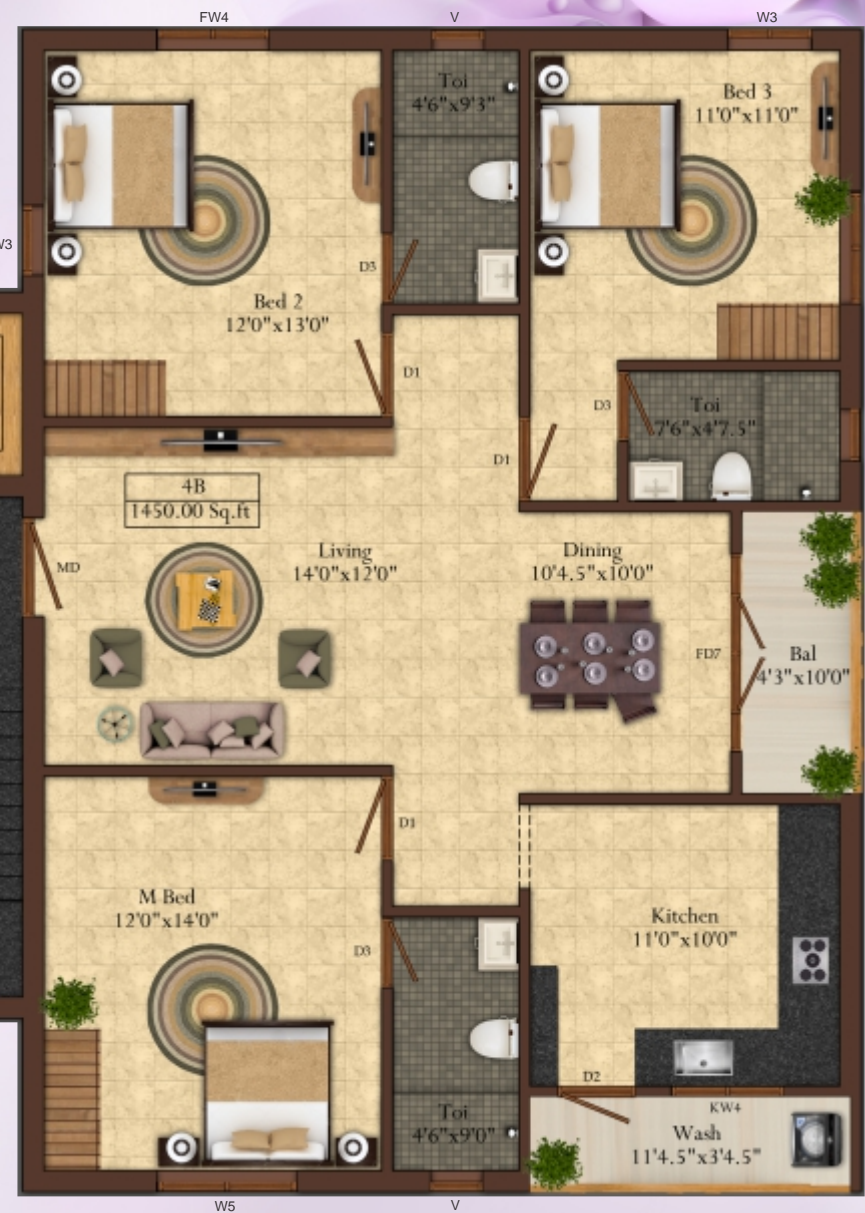
Typical Floor Plan - I, II, III, IV