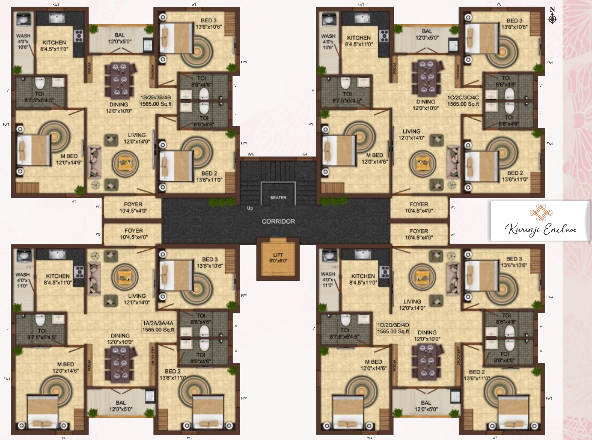
Typical Floor Plan - I,II,III,IV