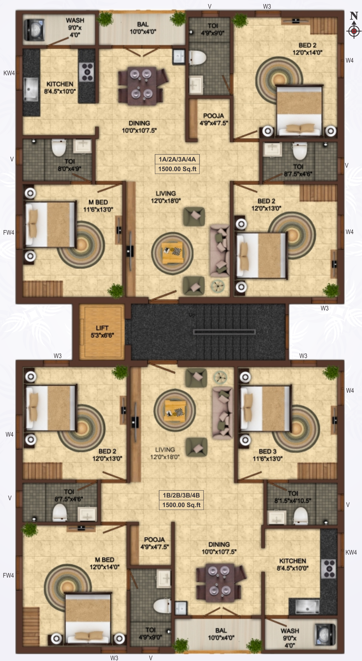
Typical Floor Plan - I, II, III, IV