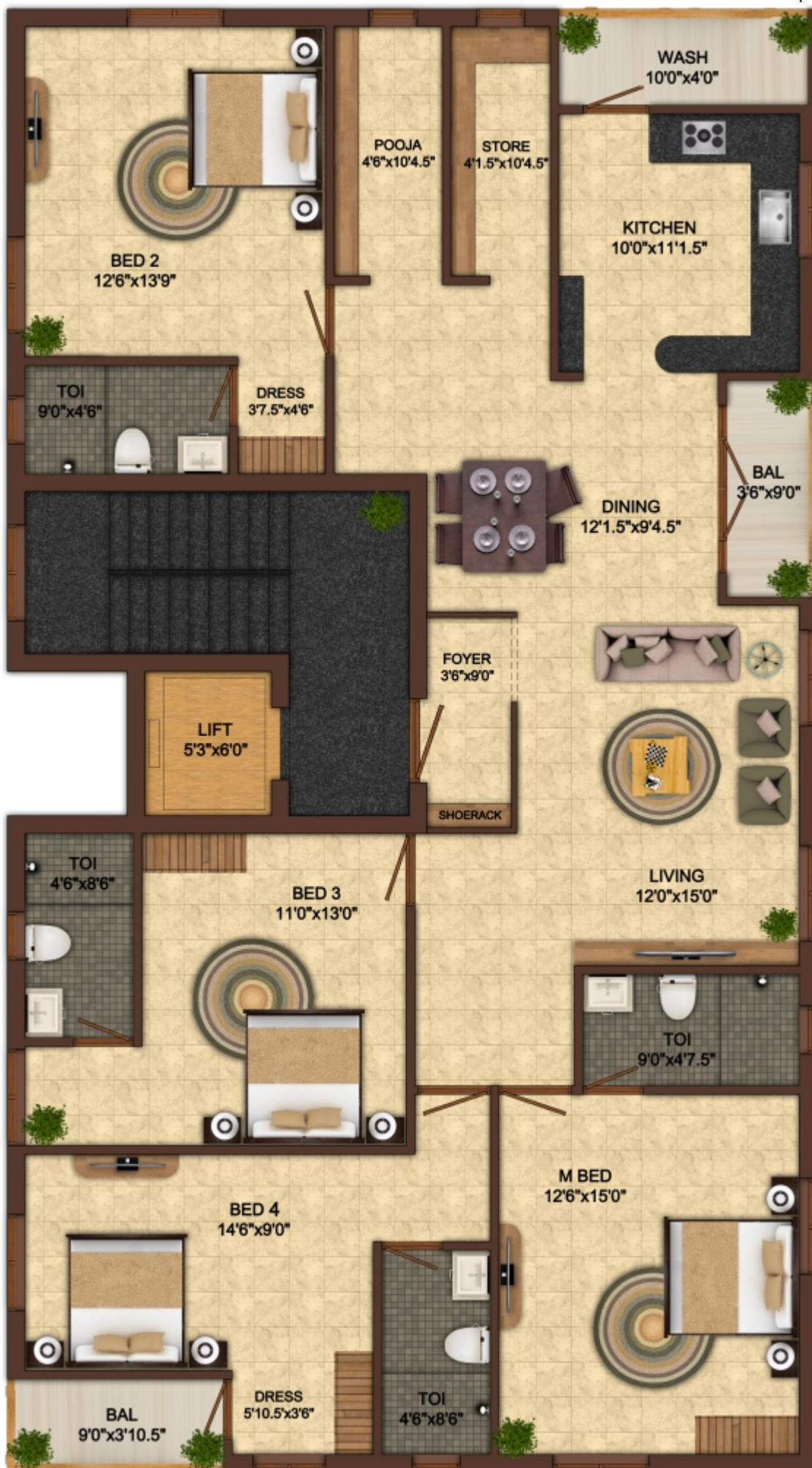
Typical Floor Plan - I, II, III, IV