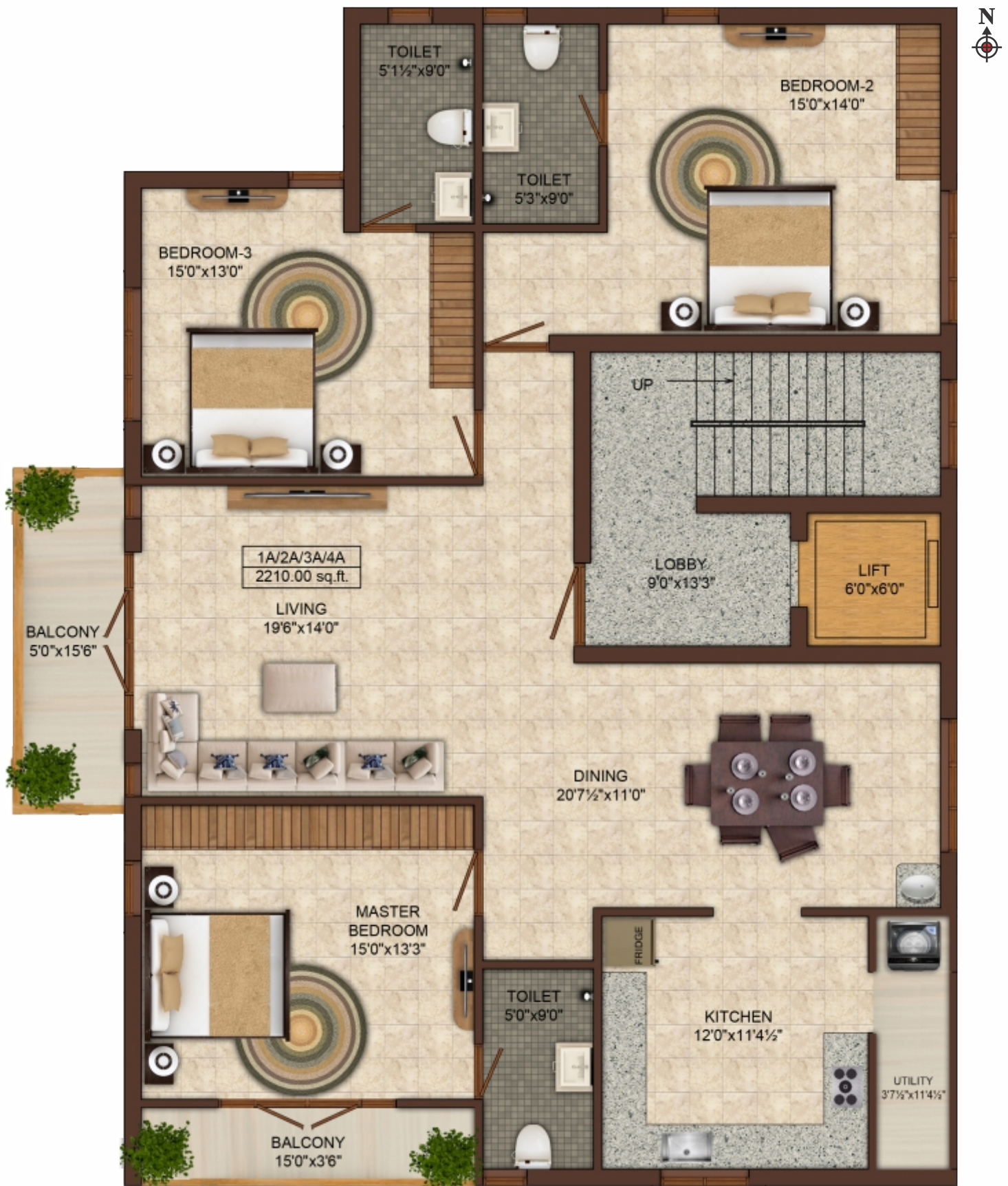
Typical Floor Plan - I, II, III, IV