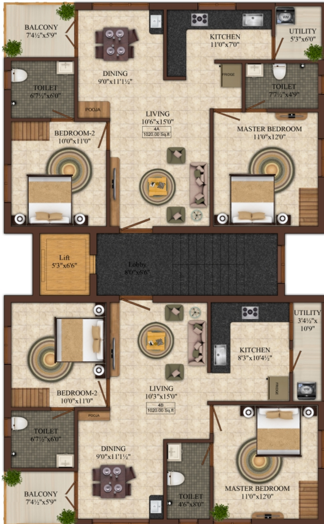
Typical Floor Plan - I, II, III, IV