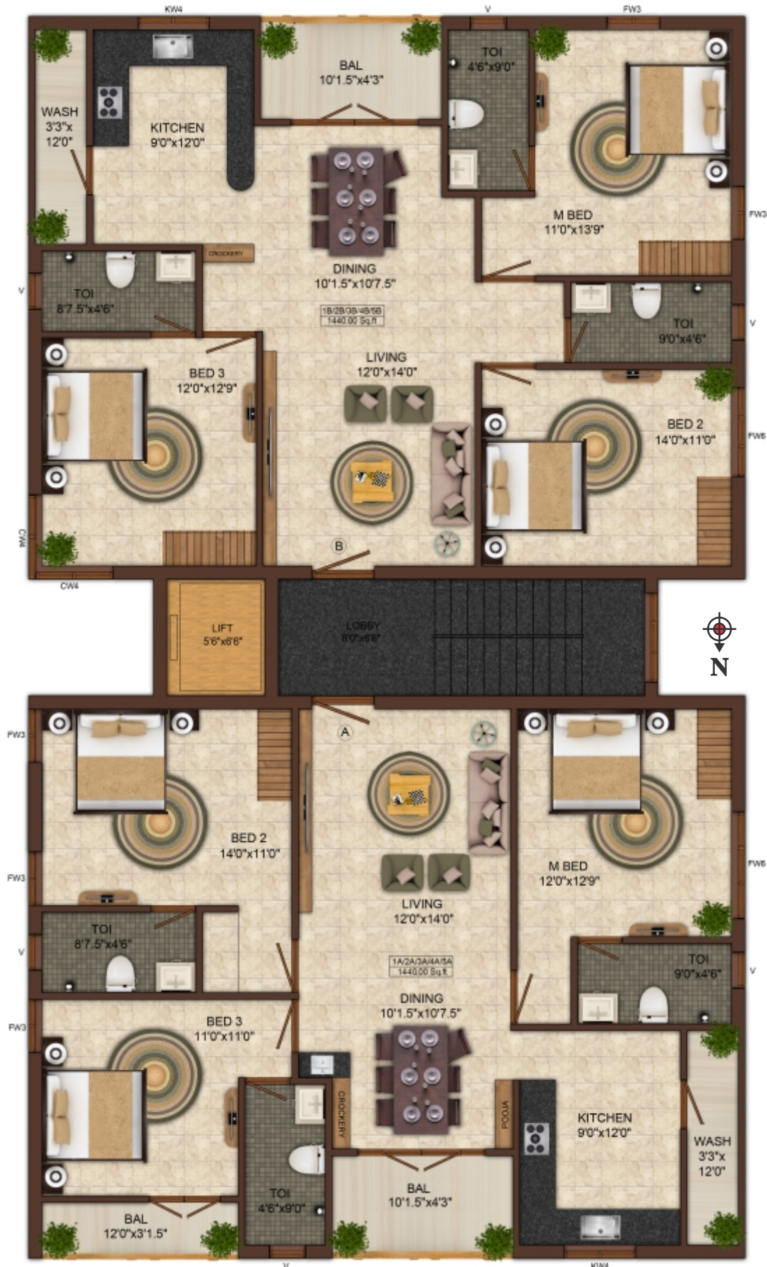
Typical Floor Plan - I, II, III, IV