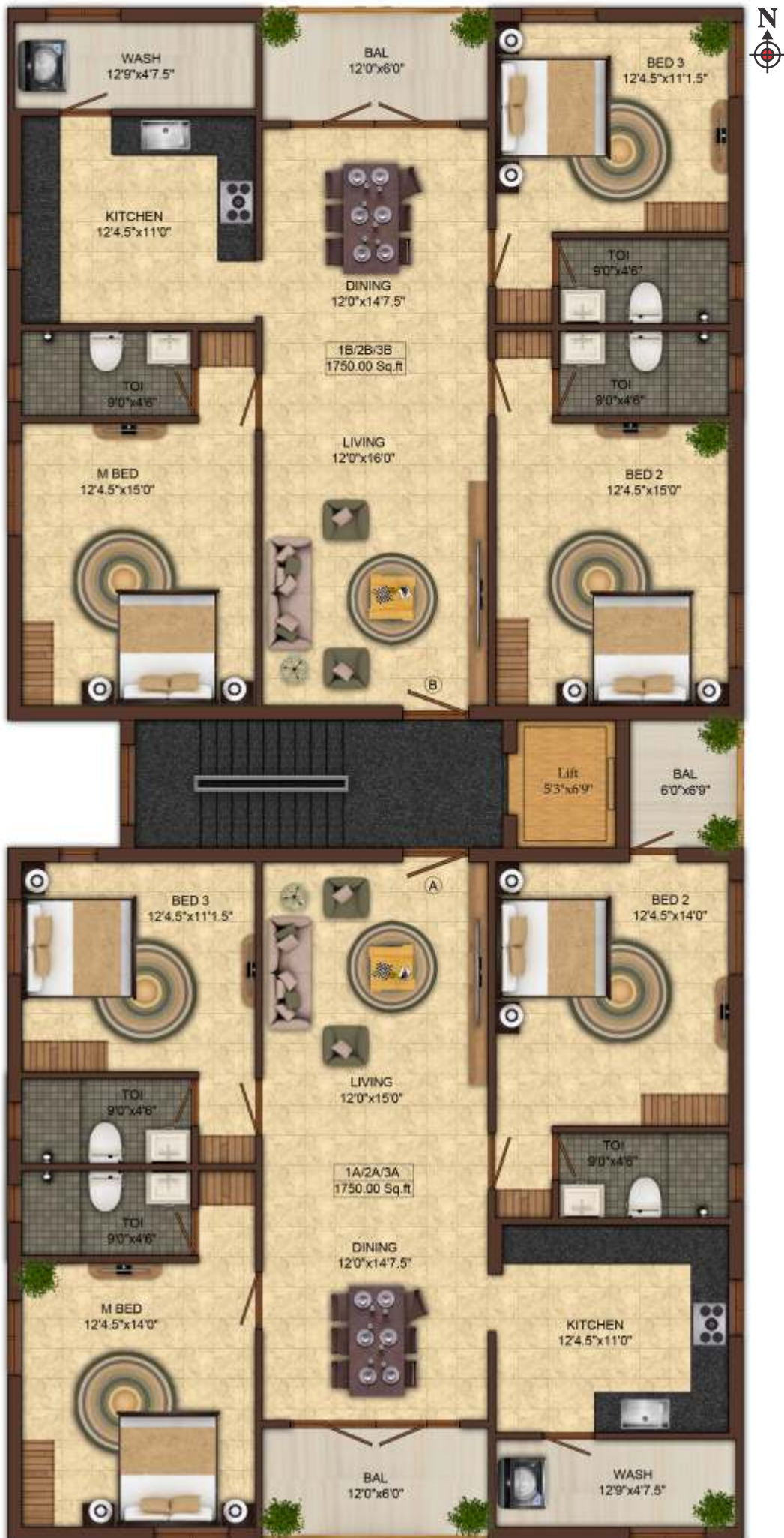
Typical Floor Plan - I, II, III